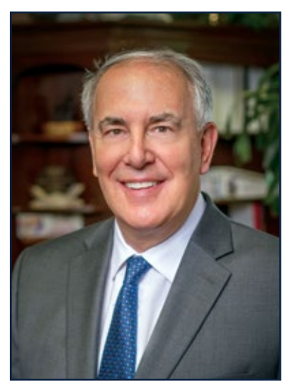
Paul Rankin Country Fair, Inc.

On the legislative front, PFMA welcomed a huge legislative victory as Governor Tom Wolf signed historic adult beverage reform allowing food retailers with a Restaurant Liquor License the ability to sell up to four bottles of wine for off-premises consumption. In addition, the bill allows the PLCB the authority to